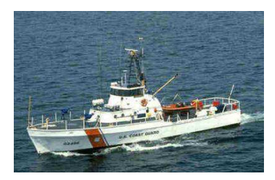
C&F is Standard of U.S. Navy, U.S. Coast Guard and US Federal Prisons!